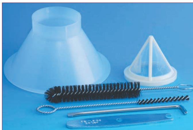
Kit contents are spray gun c/w selected air cap and tip set up, gravity cup, pouring funnel, spanner, torx key and cleaning brushes.