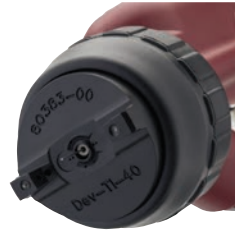
Probes built into the air cap horns for ease of painting in tight areas. Applicator atomisation components stay cleaner with no probe in the fluid path to get dirty or damaged.